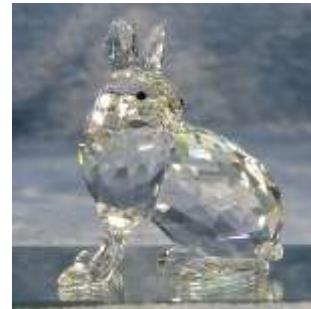
Arctic Hare 1055005