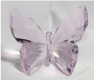
Butterfly Rosaline 1182461 (signed)