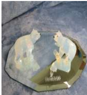
Polar Bear Cubs White Opal 1080774