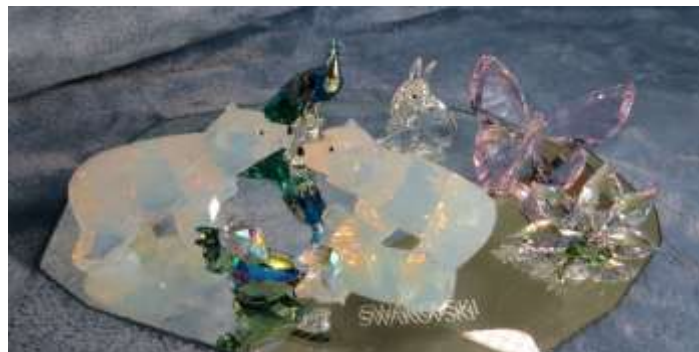
Swarovski Crystal Figurines